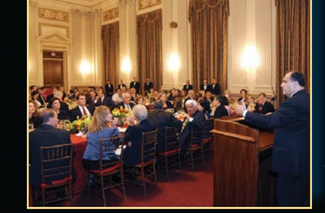
View of the dinner at the Cannon Caucus Room.