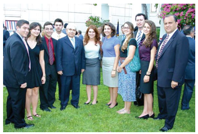
President of the Republic of Cyprus, Demetris Christofias with the students at the U.S. National Day reception at the U.S. Embassy in Cyprus.

The American Hellenic Institute Foundation (AHIF) Foreign Policy Trip to Greece and Cyprus completed its fourth year as nine students from across the United States participated in the two-week program held June 13-29, 2012.