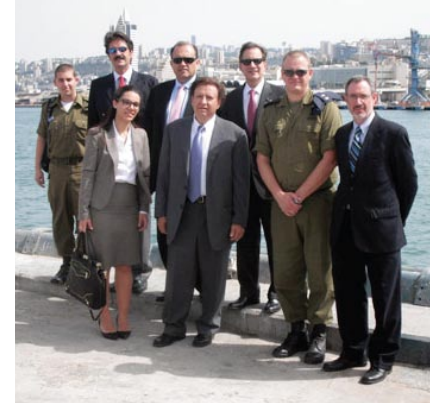
AHI delegation at Israel Defense Naval Base in Haifa.

An AHI delegation successfully completed the organization's annual leadership trip to Greece and Cyprus where it held substantive meetings with high-ranking government and religious officials and business leaders with the purpose of strengthening relations and