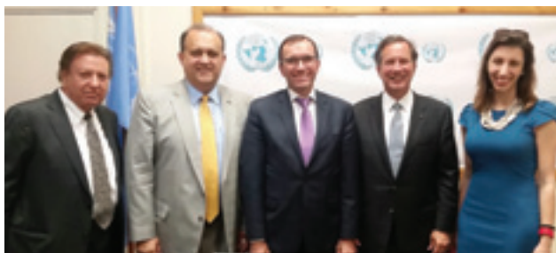
Espen Barth Eide, U.N. Special Adviser on Cyprus with the AHI delegation.