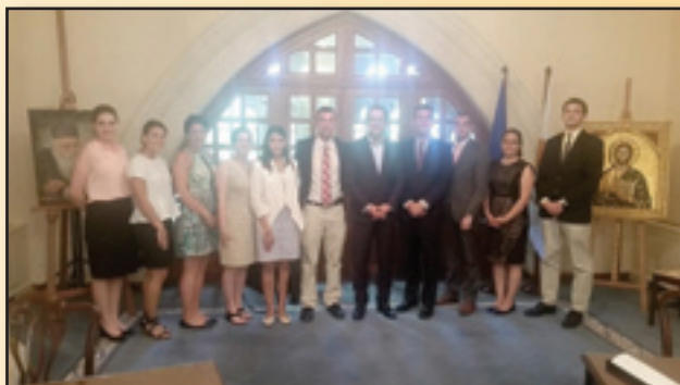
Students with Government Spokesman Nicos Christodoulides.