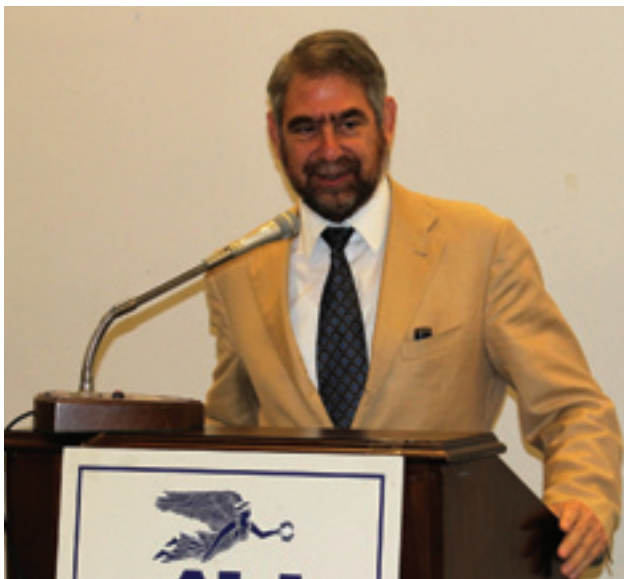
Ambassador Leonidas Pantelides

AHI marked the 42 nd anniversary of Turkey's illegal invasion of the Republic of Cyprus by hosting a congressional briefing to discuss the current state of affairs on the island at the Rayburn House Office Building on Capitol Hill, July 14. The briefing's forum allowed members of Congress to share their perspectives on the Cyprus issue and prospects for a solution amid the current settlement talks, which would be greatly aided with the removal of Turkish troops from the island. The legislators also called for continued U.S. engagement on Cyprus.