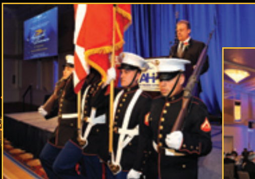
Presentation of the colors by the United States Marine Corps.