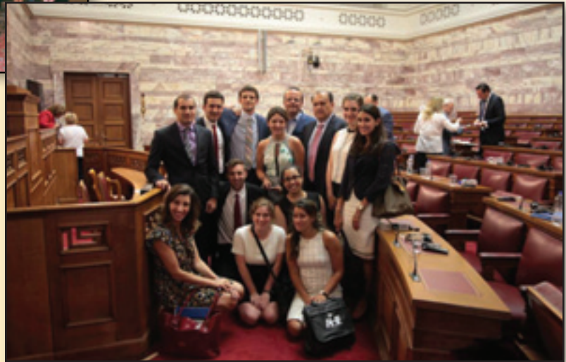
The students after testifying before the Special Permanent Committee on Greeks Abroad inside the Greek Parliament building.