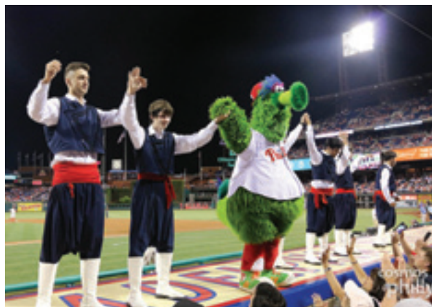
The Olympians and the Phillie Phanatic.

AHI organized its Third Annual Greek Heritage Night held in cooperation with Major League Baseball's Philadelphia Phillies, June 2 at Citizens Bank Park, Philadelphia, Pa. Approximately 700 persons from the Tri-State Philadelphia area were in attendance to see the Philadelphia Phillies take on the Milwaukee Brewers.