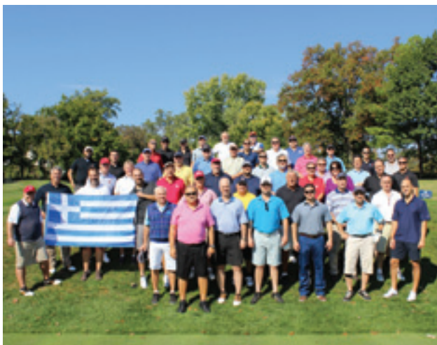
AHI golf tournament participants.