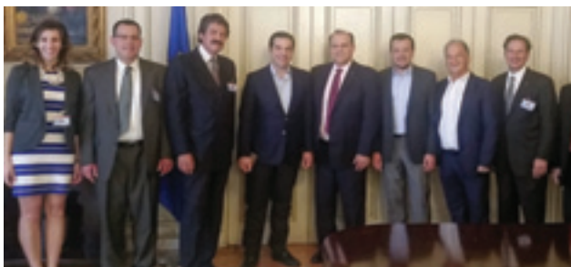
AHI delegation with Prime Minister Alexis Tsipras and Minister of State Nikos Pappas at the Maximos Mansion.