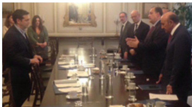
Delegation with Greek Prime Minister Alexis Tsipras.

with high-ranking government and military officials—in addition to local community leaders—from the three countries and the United States. The Mission also visited military installations at Palmachim Air Base, Yavne, Israel and Souda Bay, Crete, Greece. The other participating organizations included: American Hellenic Educational Progressive Association (Order of AHEPA), B'nai B'rith International, and the Conference of Presidents of Major American Jewish Organizations.