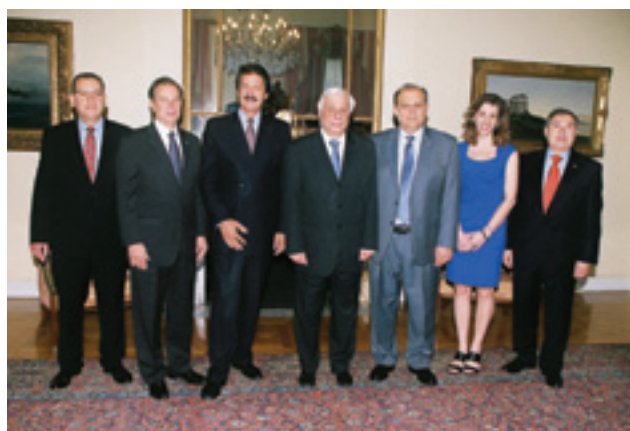
President Prokopis Pavlopoulos with AHI delegation at the Presidential Palace.