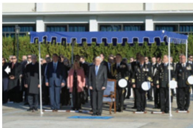
Celebration for the Hellenic Navy, on the Feast Day of Saint Nicholas, at the Greek Naval Academy at Piraeus, President Prokopis Pavlopoulos pictured at center.

In Athens, Larigakis attended a series of meetings with government officials, Nov. 30 to Dec. 7, including: U.S. Ambassador to Greece Geoffrey Pyatt, Dec. 7; Defense Minister Panos Kammenos, Nov. 30; Foreign Minister Nikos Kotzias, Dec. 1; and Minister of Tourism Elena Kountoura,