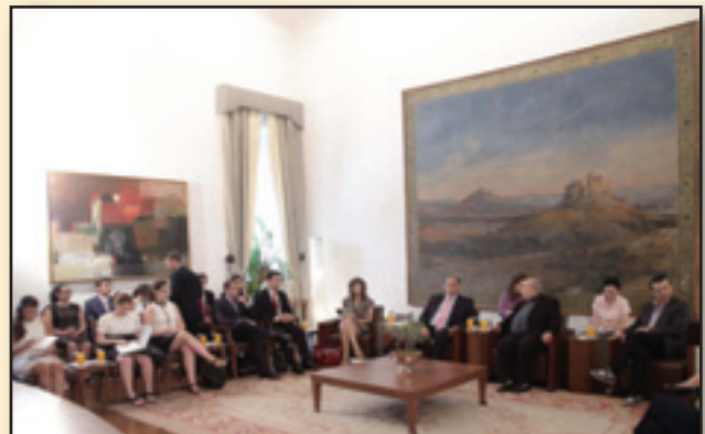
Students meeting with speaker of the Hellenic Parliament, Nikos Voutsis.