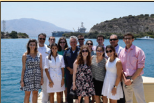
Students touring Souda Bay.