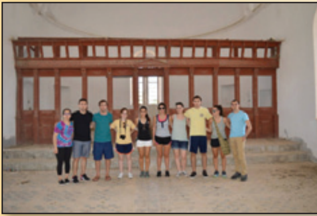
Students at a desecrated church.