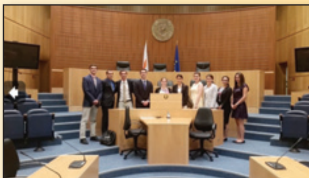
Students touring the House of Representatives of Cyprus.