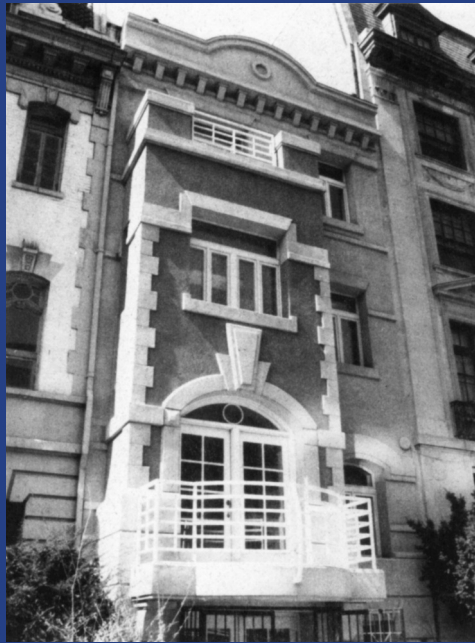
AHI's Hellenic House Headquarters...a few steps from the White House.

The American Hellenic Institute, Inc. (AHI) was founded in Washington, DC, 42 years ago to establish a professional Greek American lobby organization following Turkey's invasion of Cyprus in 1974. AHI is a 501(c)(6) non-profit organization. AHI and its affiliate organization, the AHI Foundation (AHIF), work together to provide a bipartisan program for strengthening US relations with Greece and Cyprus and within the Greek American Community. The following are some of our activities: