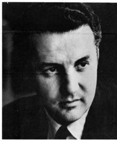
Paul Sarbanes of Maryland will win a seat in the United States Senate!

America needs leaders! Come and meet two of our best: