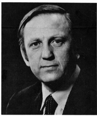
John Brademas of Indiana will be Democratic Whip in Congress!

WE'RE PROUD OF THEM! HELP THEM WIN BIG! GIANT CAMPAIGN RALLY CRYSTAL PALACE BALLROOM 7:30-10PM MONDAY NIGHT, OCTOBER 4 MINIMUM CONTRIBUTION $25 PER PERSON