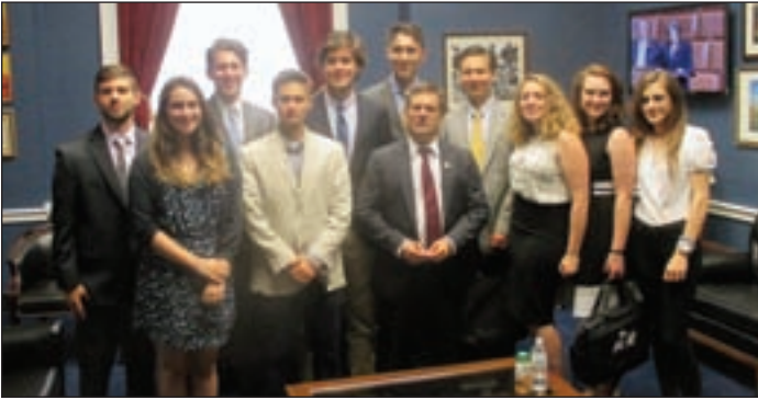
Students meeting with Congressman Gus Bilirakis (R-FL), co-chair of the Congressional Hellenic Caucus.