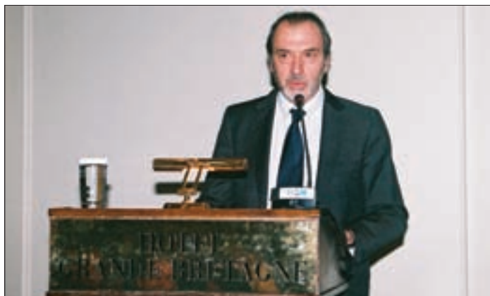
Ambassador Christos Panagopoulos, Ambassador of Greece to the United States, offering closing remarks.