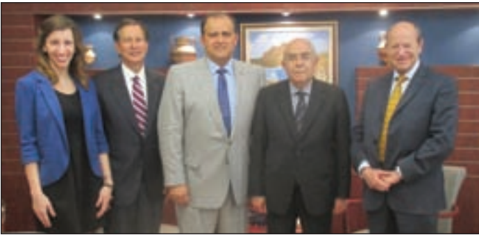
President of the House of Representatives, Yiannakis Omirou, with the delegation.