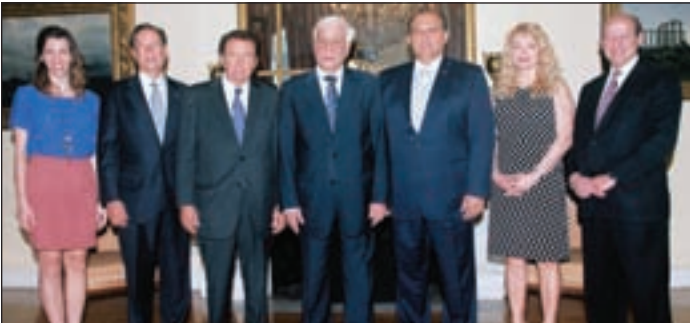
Meeting with President of Greece, Prokopis Pavlopoulos.