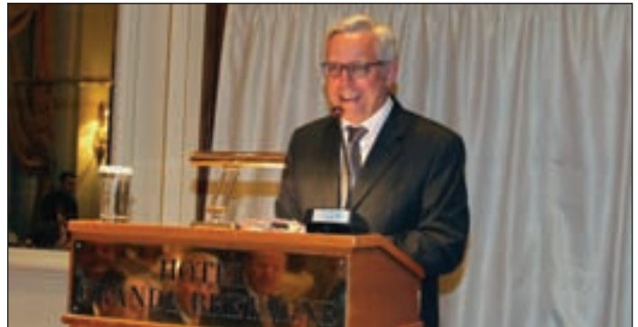
Ambassador David Pearce, ambassador of the United States to Greece.

AHI hosted a panel discussion titled “The Greek Crisis: What is next for Greece and the Eurozone?,” June 10, 2015, at the Cap-