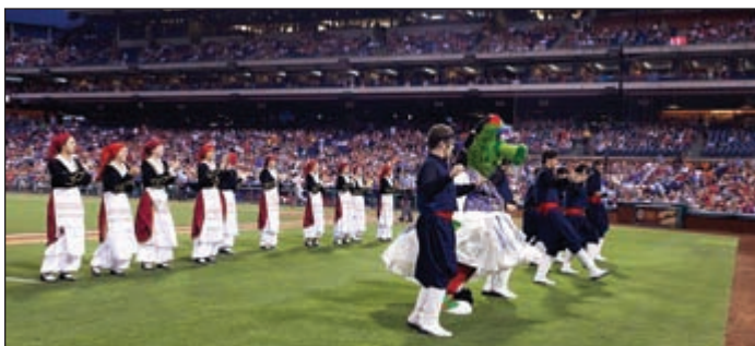
During the middle of the fifth inning, the Phillie Phanatic, sporting an Evzone costume, led The Olympians, a Greek dance troupe from St. Luke's Greek Orthodox Church.

the Tri-State Philadelphia area and Baltimore to see the Philadelphia Phillies take on the Baltimore Orioles.