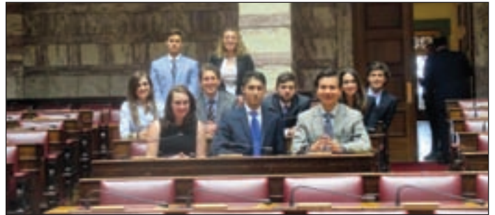
Students tour the Greek Parliament chambers.