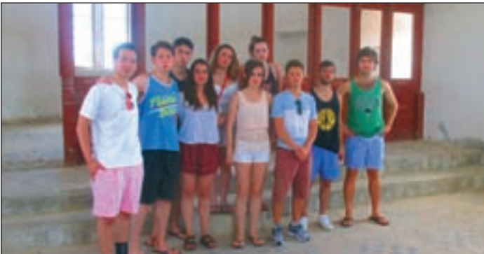
Students at a desecrated church in the occupied part of Cyprus.