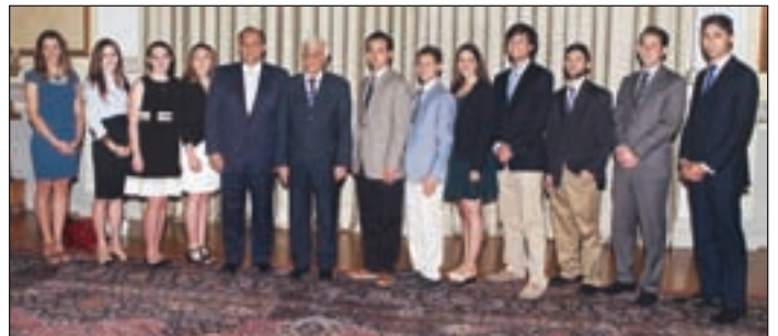
President Pavlopoulos with the students.