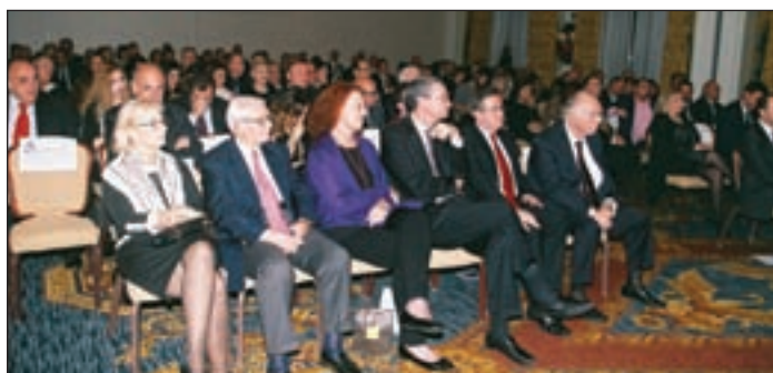
Event attendees at the Grande Bretagne.