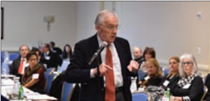
Senator Paul Sarbanes, addressing the panel during the Q&A.