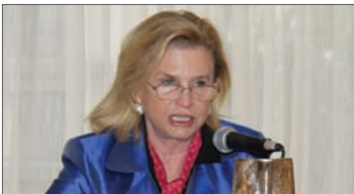
Congresswoman Carolyn Maloney.

AHI hosted a forum entitled, “Greece Moving Forward: Implications and Realities” featuring three panels of experts on October 27, 2015 at the Capital Hilton, Washington, DC.