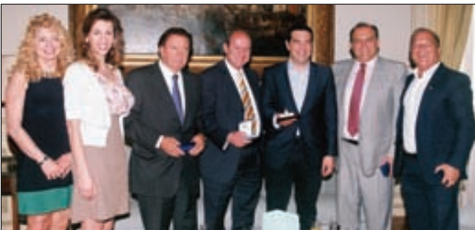
Delegation pictures with Prime Minister Alexis Tsipras.