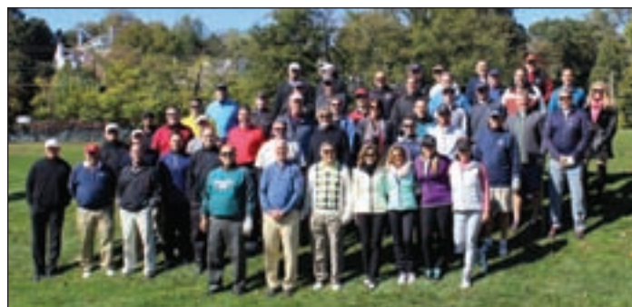
Golf tournament participants.