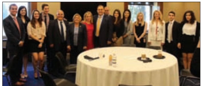
Event attendees with Ambassador Chacalli, Congresswoman Ros-Lehtinen, Congresswoman Maloney, Nick Larigakis and Greek defense attaché Colonel Papadopoulos.

AHI marked the 41st anniversary of Turkey's illegal invasion of the Republic of Cyprus by hosting a congressional briefing to discuss the current state of affairs on the island at the Rayburn House Office Building on Capitol Hill, July 22, 2015. The briefing's forum allowed members of Congress to share their perspectives on the Cyprus issue, prospects for a solution amid the current settlement talks, and how Cyprus can be advanced on the policy agenda of Capitol Hill.